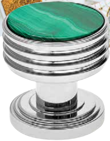
Sherle Wagner International's Keystone nickel doorknob is inset with malachite; price upon request. sherlewagner.com