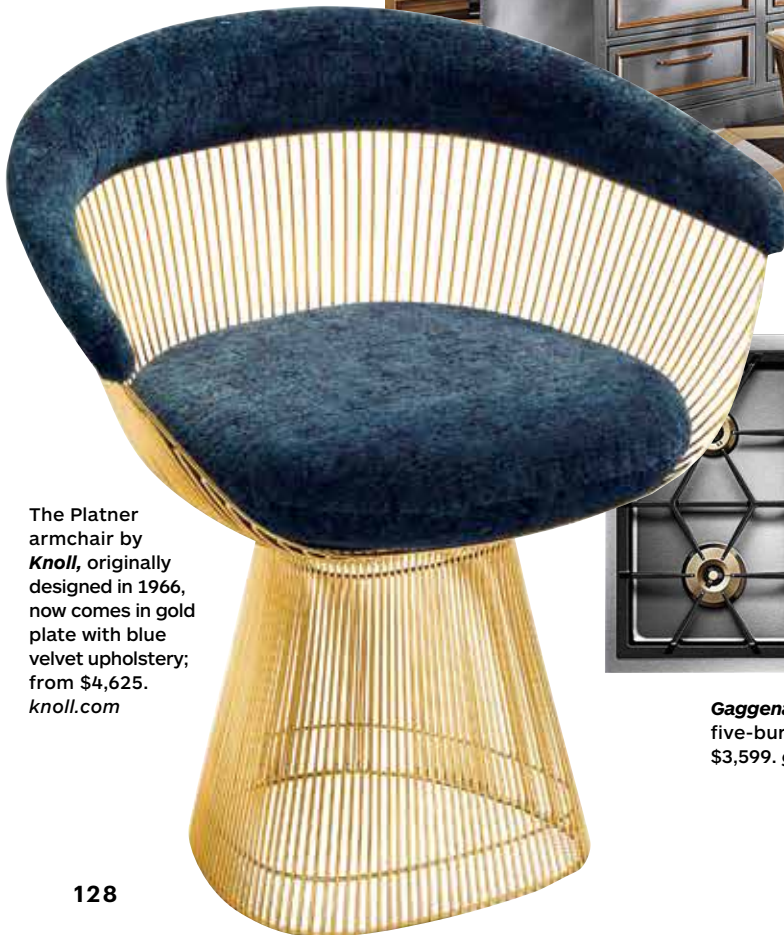
The Platner armchair by Knoll , originally designed in 1966, now comes in gold plate with blue velvet upholstery; from $4,625. knoll.com