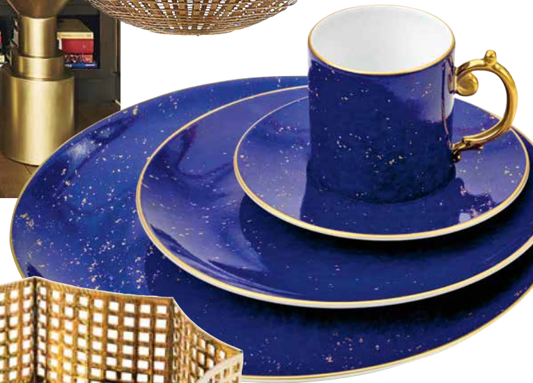
L'Objet's Lapis espresso-cup-and-saucer set and canapé and dessert plates; from $80. l-objet.com