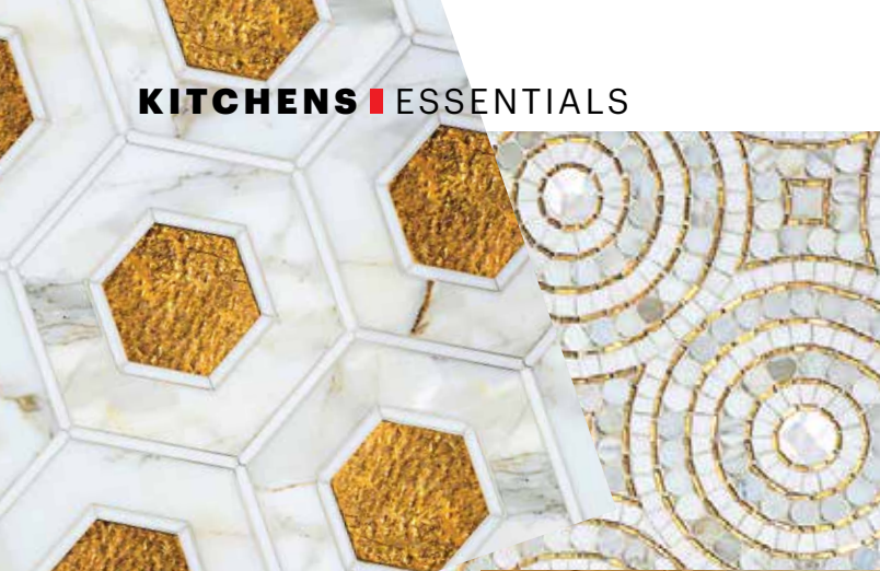
Ruche (far left) and Orson glass mosaic tiles by New Ravenna are accented with 24K gold; prices upon request. new-ravenna.com