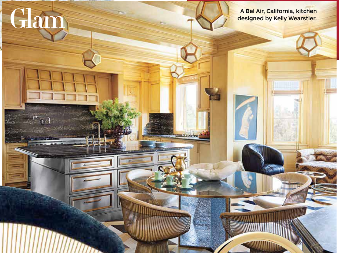
A Bel Air, California, kitchen designed by Kelly Wearstler.