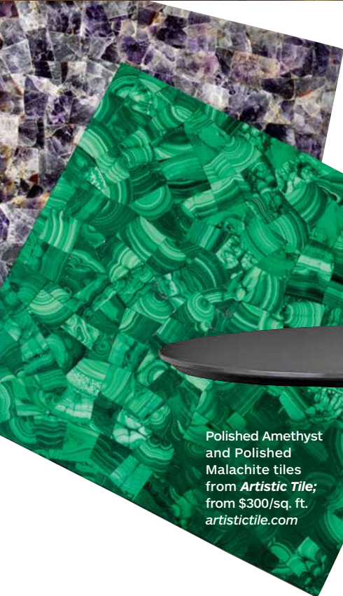
Polished Amethyst and Polished Malachite tiles from Artistic Tile ; from $300/sq. ft. artistictile.com