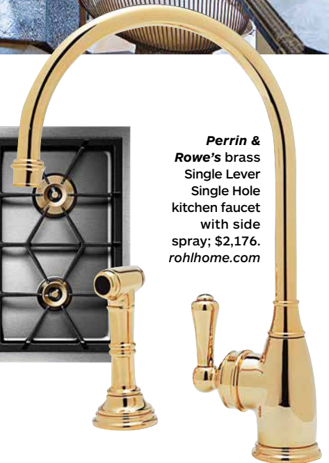
Perrin & Rowe's brass Single Lever Single Hole kitchen faucet with side spray; $2,176. rohlhome.com

TILES: COURTESY OF NEW RAVENNA; CHAIR: COURTESY OF KNOLL; COOKTOP: COURTESY OF GAGGENAU; FAUCET: COURTESY OF ROHL