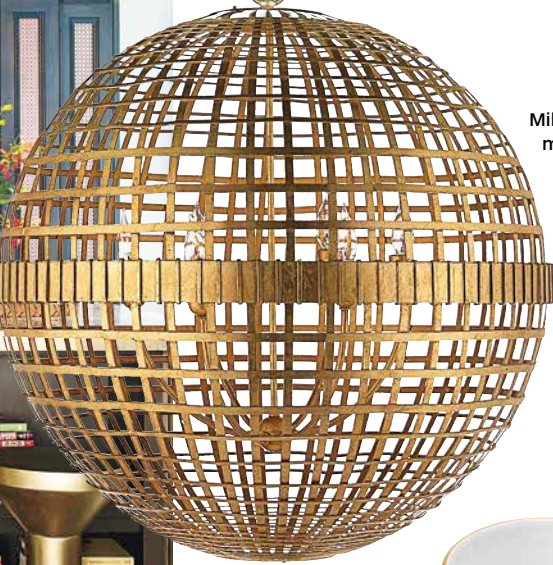
Mill gilded-metal ceiling light by Aerin ; $2,722. aerin.com