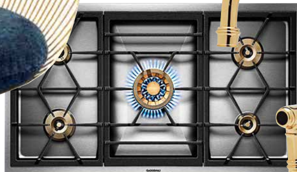
Gaggenau's VG 491 Vario five-burner gas cooktop; $3,599. gaggenau.com