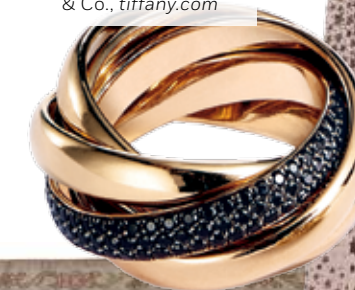
Paloma's Melody ring crafted from interlocking bands of 18-carat rose gold with one pavé black spinel band that highlights the fluid design, Tiffany & Co., tiffany.com

The color pink can be bold or subdued, feminine and, yes, even masculine. But it's always versatile in the home.