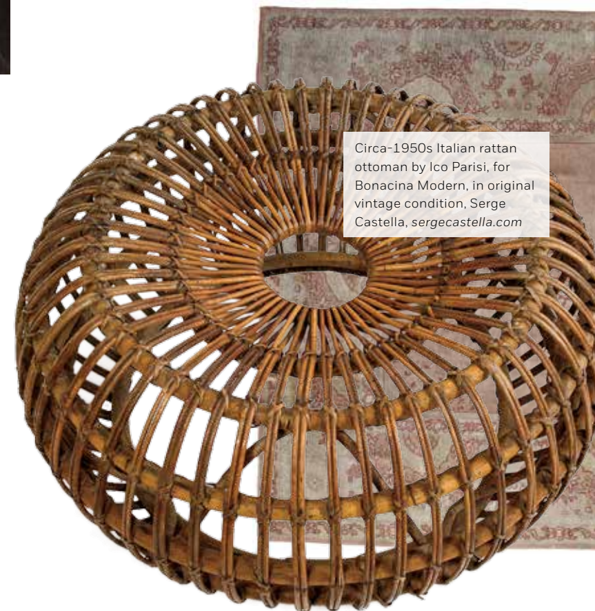
Circa-1950s Italian rattan ottoman by Ico Parisi, for Bonacina Modern, in original vintage condition, Serge Castella, sergecastella.com