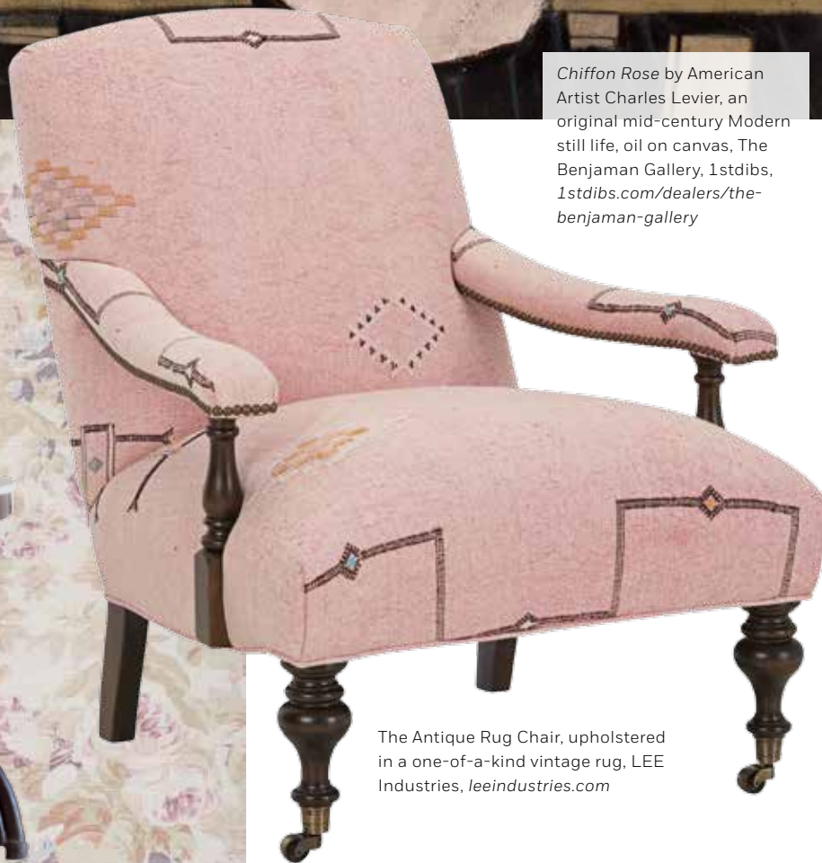
The Antique Rug Chair, upholstered in a one-of-a-kind vintage rug, LEE Industries, leeindustries.com