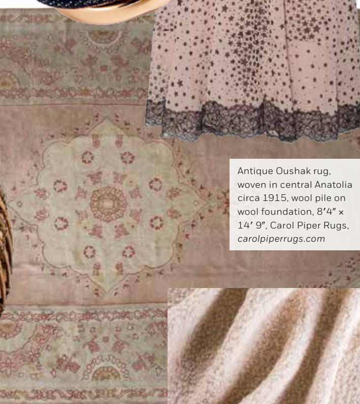
Antique Oushak rug, woven in central Anatolia circa 1915, wool pile on wool foundation, 8'4" x 14' 9", Carol Piper Rugs, carolpiperugs.com