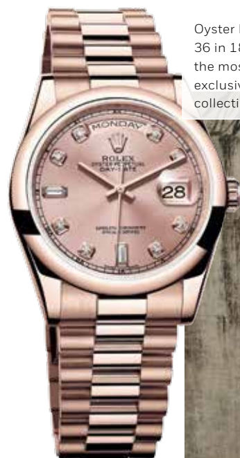
Oyster Perpetual Day-Date 36 in 18-carat Everose Gold, the most prestigious and exclusive watch in the Oyster collection, Rolex, rolex.com