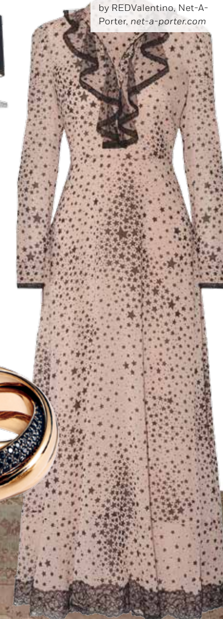
Lace-trimmed printed stretch-silk Georgette gown finished with lace and Swiss-dot tulle ruffles along the high neckline and hem, by REDValentino, Net-A-Porter, net-a-porter.com