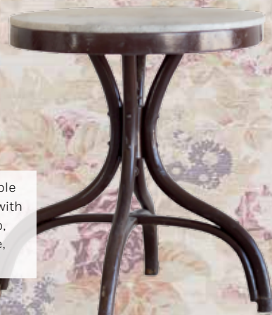
Vintage occasional table in dark painted wood with a light gray marble top, circa 1940, Eloquence, eloquenceinc.com