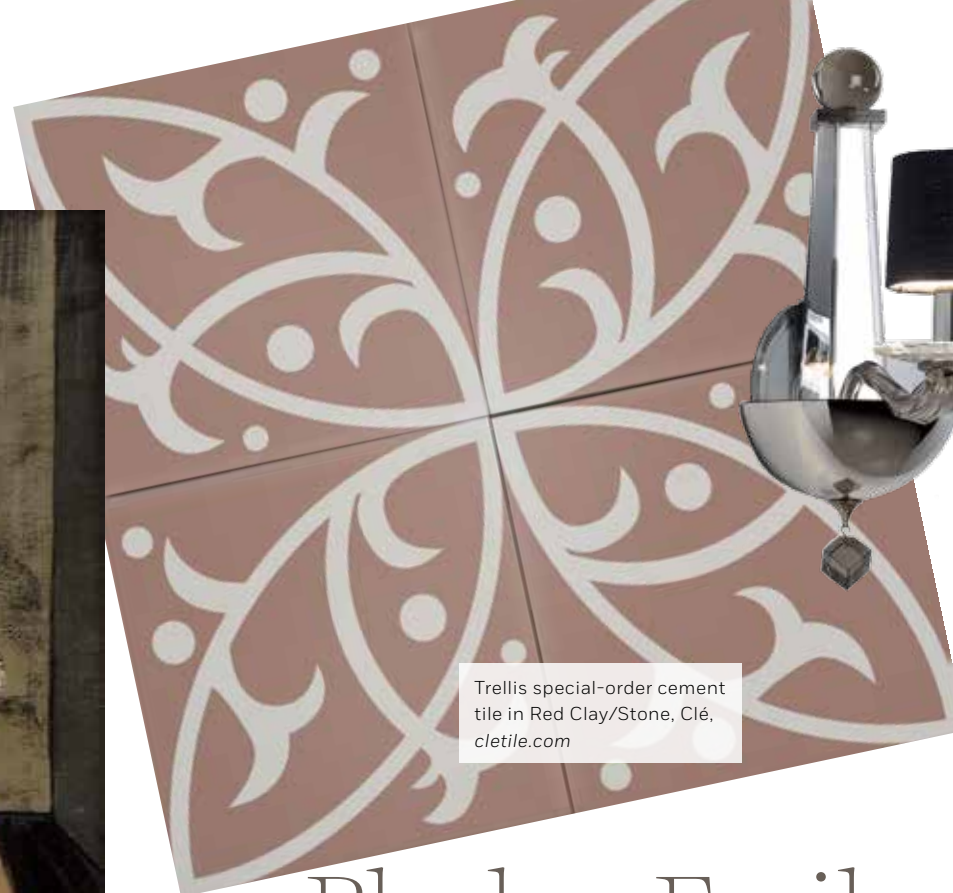
Trellis special-order cement tile in Red Clay/Stone, Clé, cletile.com