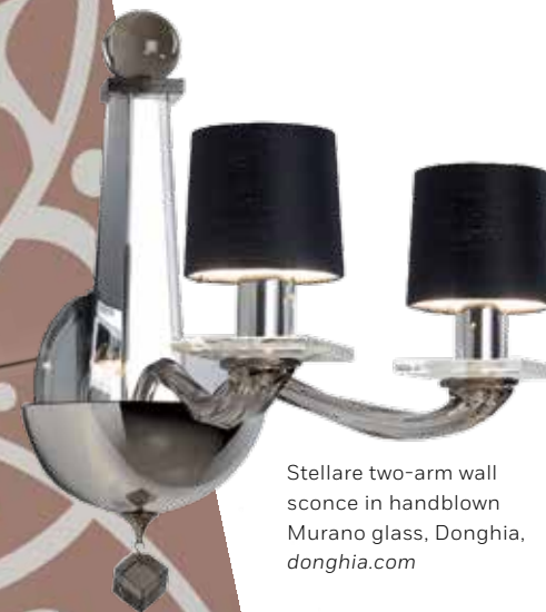
Stellare two-arm wall sconce in handblown Murano glass, Donghia, donghia.com