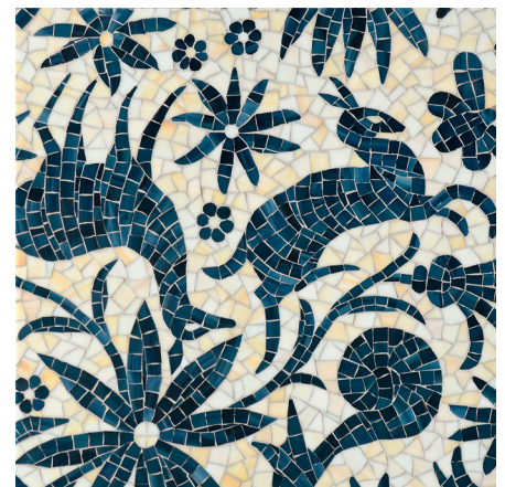
OTOMI Based on a Mexican textile design. A jewel-glass mosaic in Agate and Marcasite.