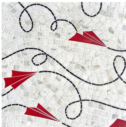
LOOP DE LOOP Paper airplanes! In Calacatta and Nero Marquina marble with Carmen glass.